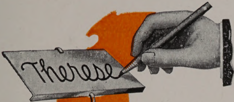
Patent Applied For

You will save enough time and labor in marking your plants to pay for these fine permanent markers the first year.